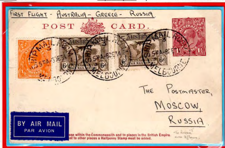
Ex Nelson Eustis – circa 3 flown to Russia

Postcard rate Australia – Russia 1s 2d. Superscription required: 'Australia-Greece-Russia'