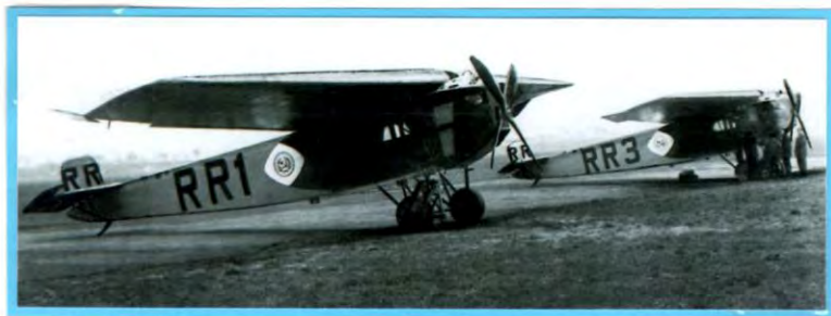
DERULUFT Fokker F.III's at Khodinka Airport, Moscow, May 1922 ready to start the service to Königsberg.

The exhibit concentrates on commercial mail with first flights showing the start of a service.